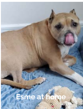
Esme at home

When we welcomed Esme, we knew she needed our help. We just didn't realize how extensive her issues were. Esme had a severe leg injury which is why we were contacted by the county shelter. Once we got her to a vet, we learned that she had more health issues to tackle. We had already started our journey with her so we weren't about to give up. Esme had multiple mammary tumors and we were told that she needed a total mastectomy as soon as possible. Our bill for this surgery including her spay was over $1600. We gave her some time to recuperate and then scheduled the repair for her ACL injury which cost $982. Throughout this entire process, her tail never stopped wagging. She knew that she was being taken care of.