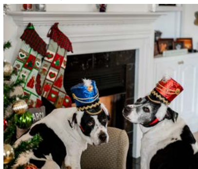
Buddy & Lilly at Christmas 2020

When we put in the applications for both, we were asked if we really wanted both – yes of course! They were obviously a family – same markings, coloring, and size – and we didn't want to separate them.